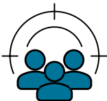
Consumer identity information