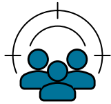
Consumer identity information